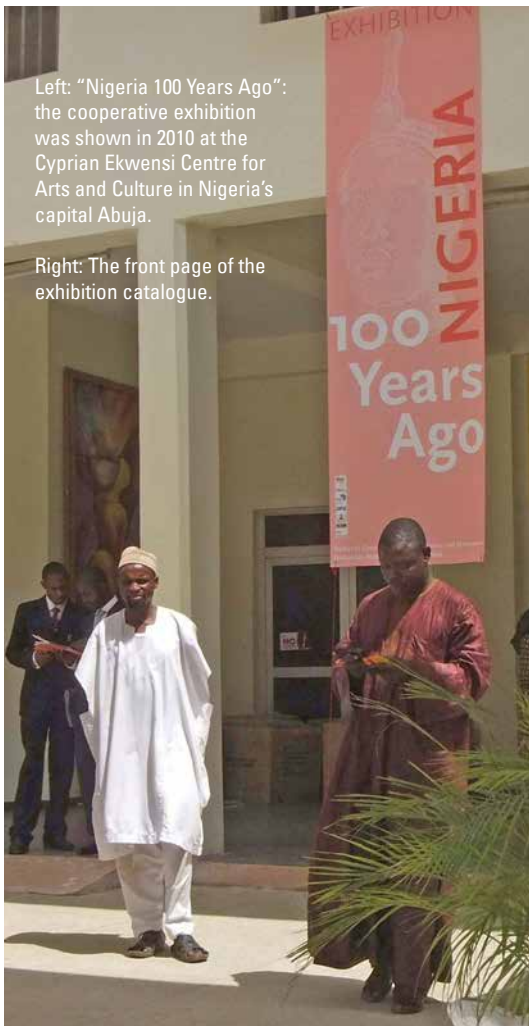
Right: The front page of the exhibition catalogue.